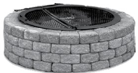
42" FIRE PIT