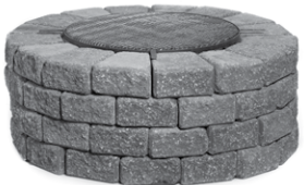
ROMANSTACK FIRE PIT