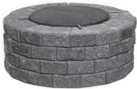
STACKSTONE FIRE PIT

A 42" inside diameter fire pit can also be constructed to accommodate a hinged grill, but check with local bylaw regulations prior to construction.